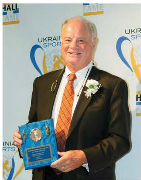
Orest Kindrachuk of the National Hockey League's Philadelphia Flyers, Pittsburgh Penguins and Washington Capitals.